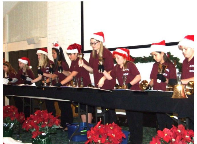
"St. John's Joyful Bells"

Christmas Party Luncheon entertainment provided by St. John's Lutheran Church.